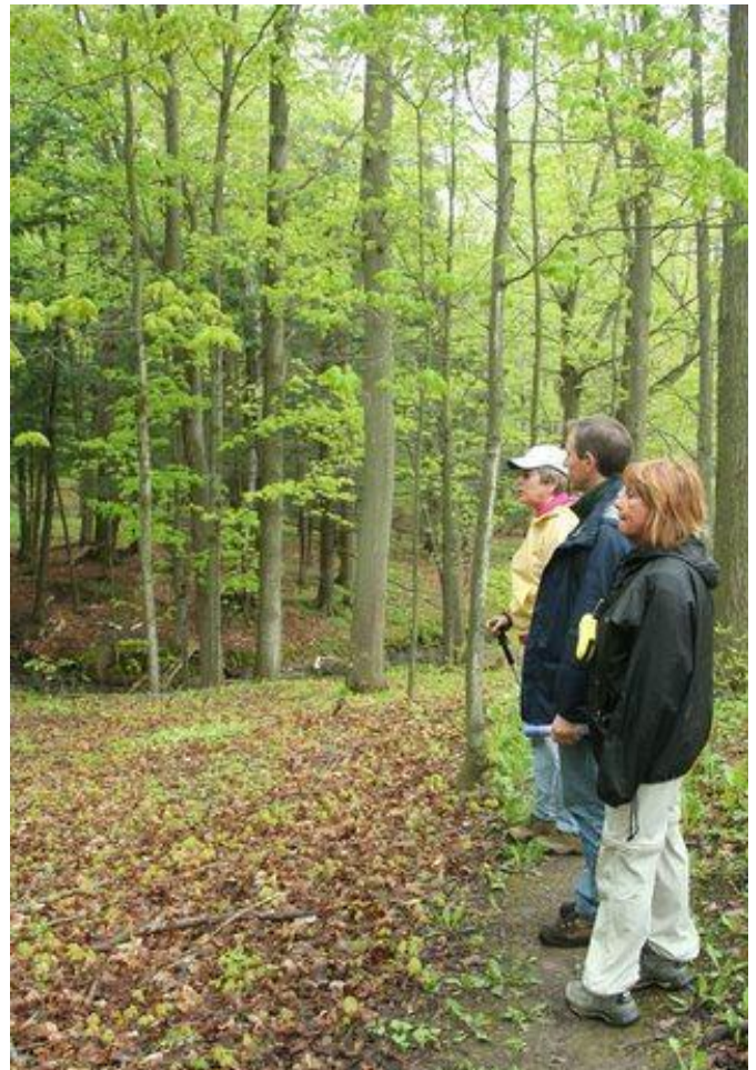
Happy Valley Forest

Situated in the Happy Valley forest, considered a national conservation priority area by the NCC, the property is dominated by a woodland of Sugar Maple – Beech in great condition with a tall, closed canopy. The Oak Ridges Trail winds up and down the dramatic rolling hills and valleys which typify the moraine through the property. A watercourse flows through the woodland to the northwest and into the Pottageville Swamp.