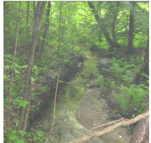
Whitchurch - Stouffville

The Land Trust is happy to discuss securement options with any landowner – especially those that leave the property in your hands, with your commitment to growing a collective, healthy future on the Oak Ridges Moraine.