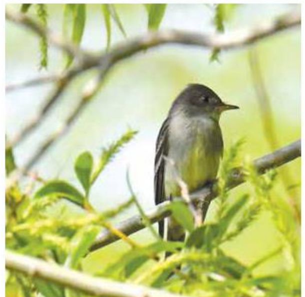
Eastern Wood-Pewee by Aileen Barclay