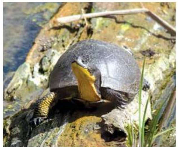
Blanding's Turtle

These projects were also supported by the Government of Canada through the Natural Heritage Conservation Program, part of Canada's Nature Fund; and the Ecological Gifts Program. This program provides enhanced tax incentives for individuals or corporations who donate ecologically significant land. Thank you also to the ECHO Foundation for providing support for the protection of all three properties. Most importantly, thank you to the land owners for making the choice to place their properties within the Land Trust.