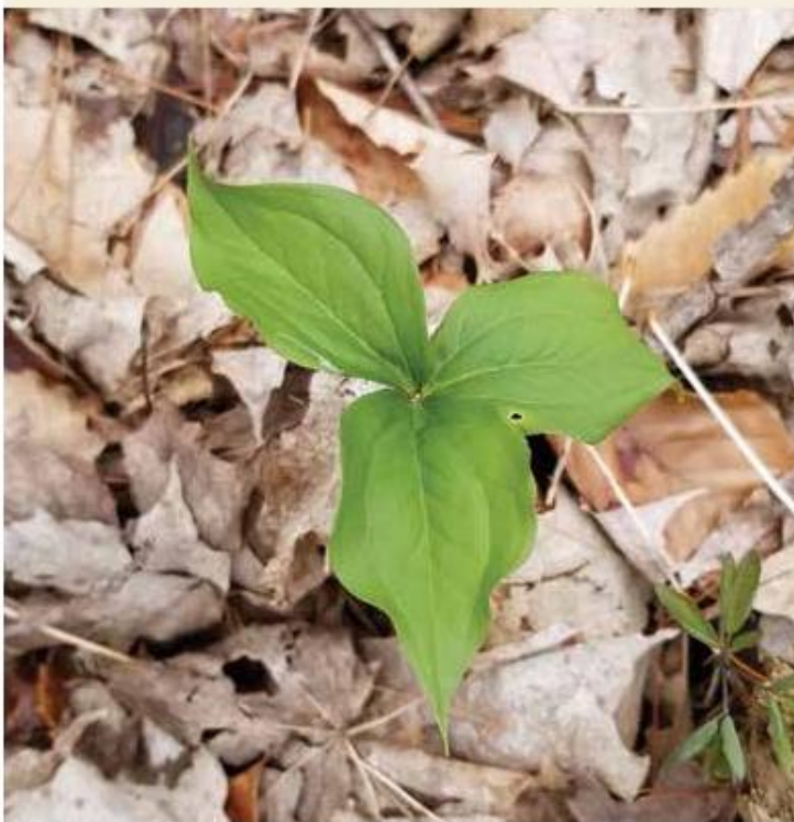
A Trillium on the McLeod property