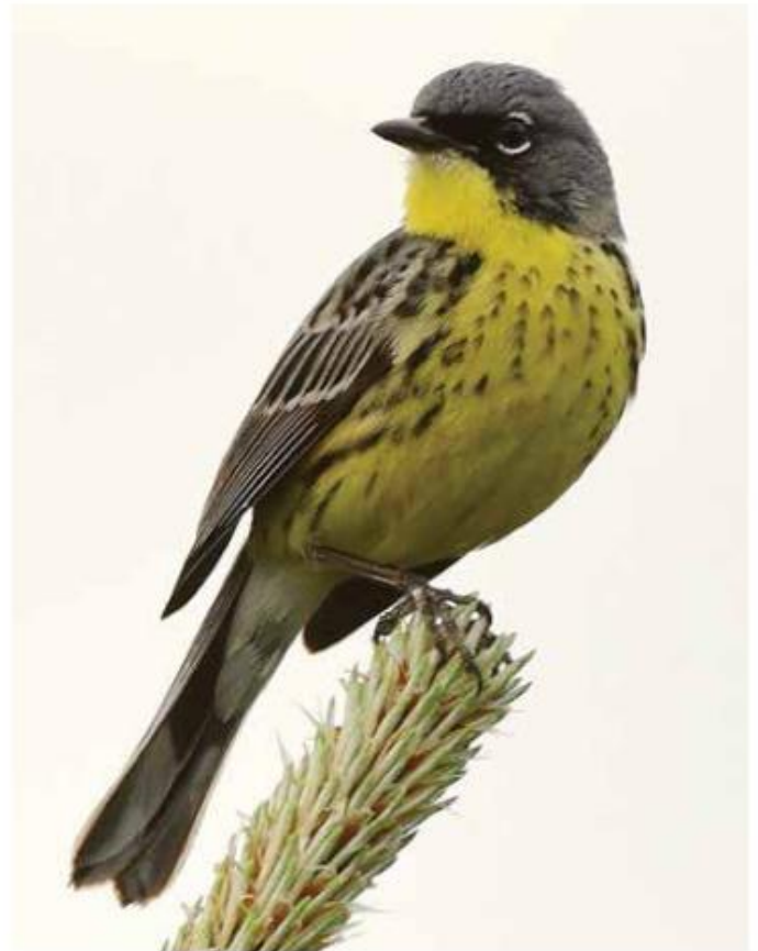
Kirtland's Warbler by Jim Forrest