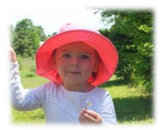
Each gift makes a difference in the lives of our children and their children. Thank you for all that you do!

18462 Bathurst Street, Newmarket, ON L3Y 4V9 Telephone: 905-853-3171 landtrust@oakridgesmoraine.org www.oakridgesmoraine.org Charitable Registration #87320 8920